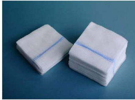
Photo 2 --- X-Ray Detectable Gauze Sponges